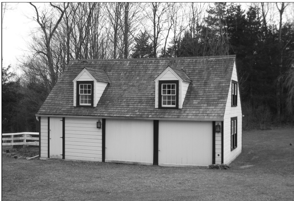
View of garage from north.

Jonas Freer Farm 100 Shivertown Road New Paltz, Ulster County