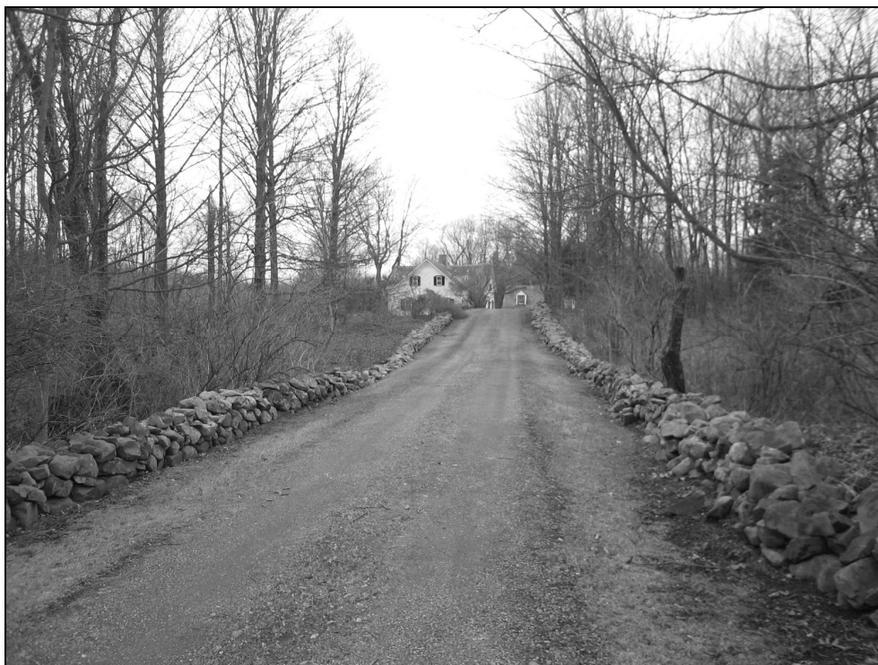
Lane entering property from north.