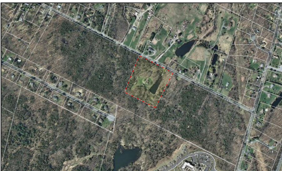
Aerial view of farm parcel & house lot

Parcel map with outline of farm lot outlined. The dotted line indicates where the lot was divided between Jonas Freer and his brother, with Jonas house and land intact on the east side. The house is located within the smaller red-outlined parcel.