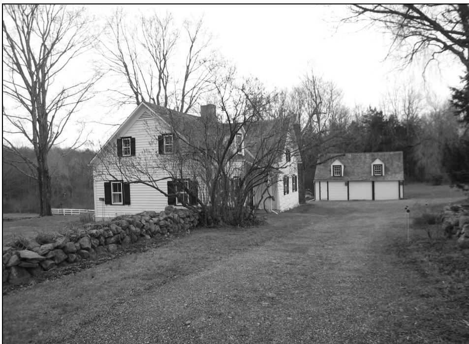
View of house from north