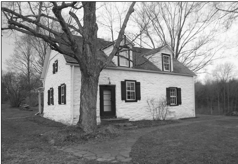
View of house from southwest

Jonas Freer Farm 100 Shivertown Road New Paltz, Ulster County