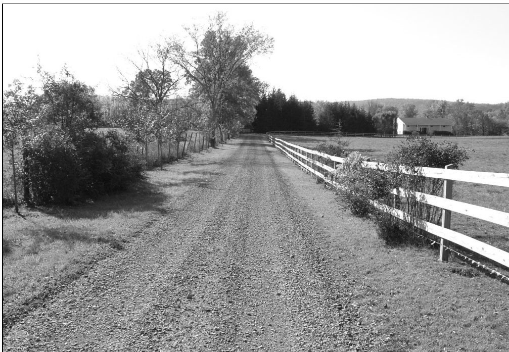
View of driveway and 1975 ranch house from the east.

Benjamin Deyo House 100-200 Saddlebred Road New Paltz, Ulster County