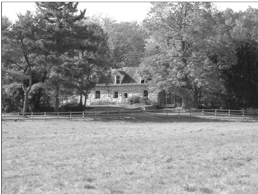
View of stone house from the southeast across the pasture.

Benjamin Deyo House 100-200 Saddlebred Road New Paltz, Ulster County