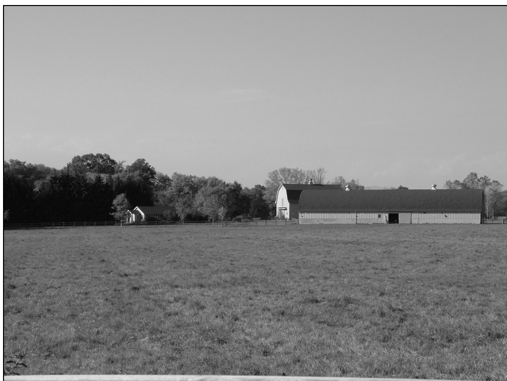
View of barns and pasture from the southeast.