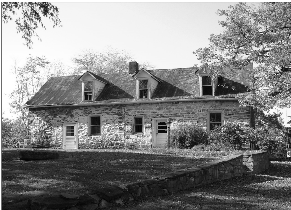
View of stone house from the southeast.

Benjamin Deyo House 100-200 Saddlebred Road New Paltz, Ulster County