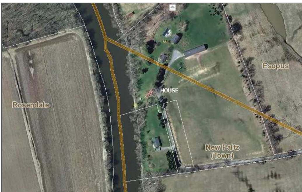
Aerial view of farm