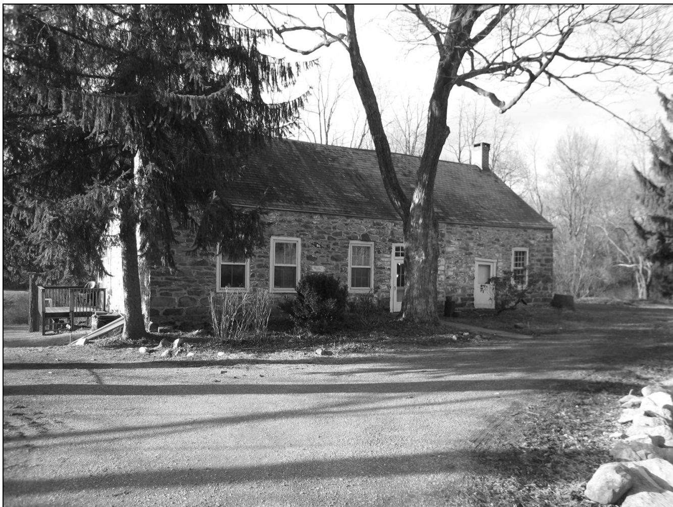
View of house situated over a hill on the west side of Old Kingston Road, from the southeast.

Petrus Hasbrouck Farm 315 Old Kingston Road New Paltz, Ulster County