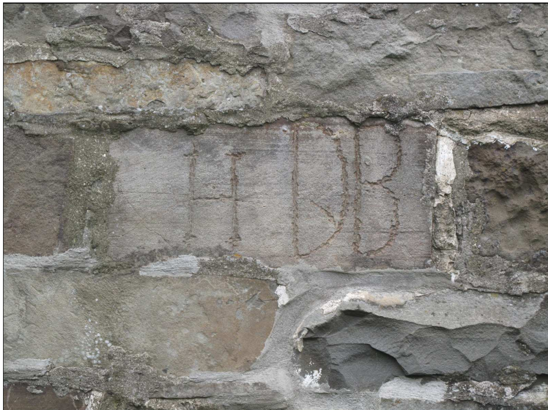
Stone incised with initials HDB (2014)

DuBois-Deyo Farm 420 N. Ohioville Road New Paltz, Ulster County