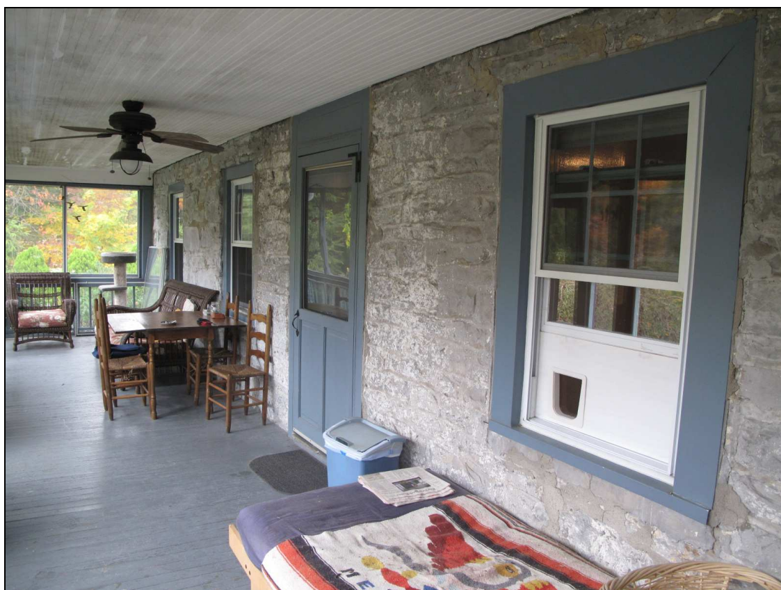
Detail of front façade (2014)