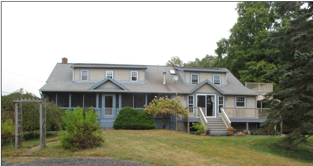
View from south (2014)

DuBois-Deyo Farm 420 N. Ohioville Road New Paltz, Ulster County