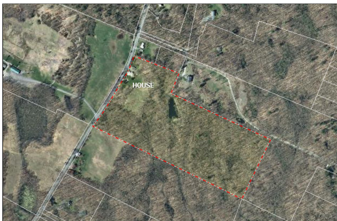
Aerial view of house parcel