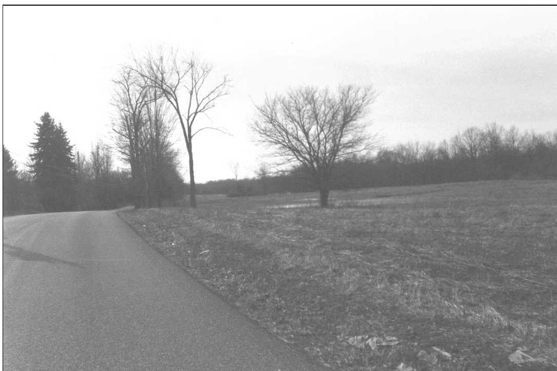
View of west side of road from north.