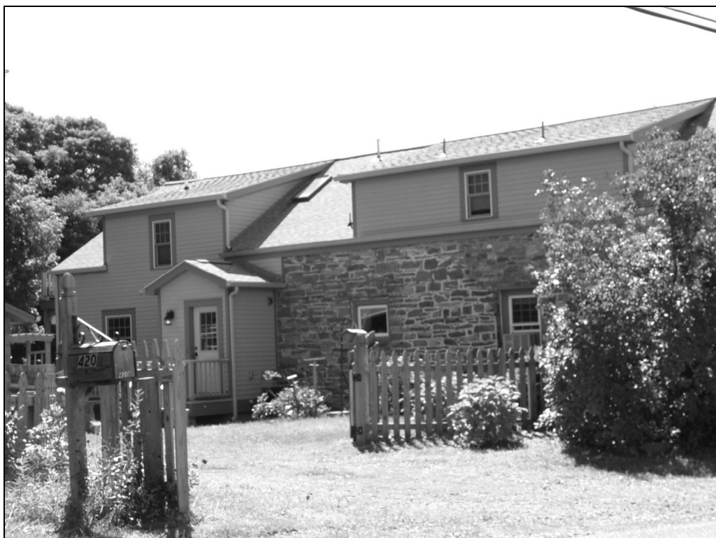
view of house from northwest.