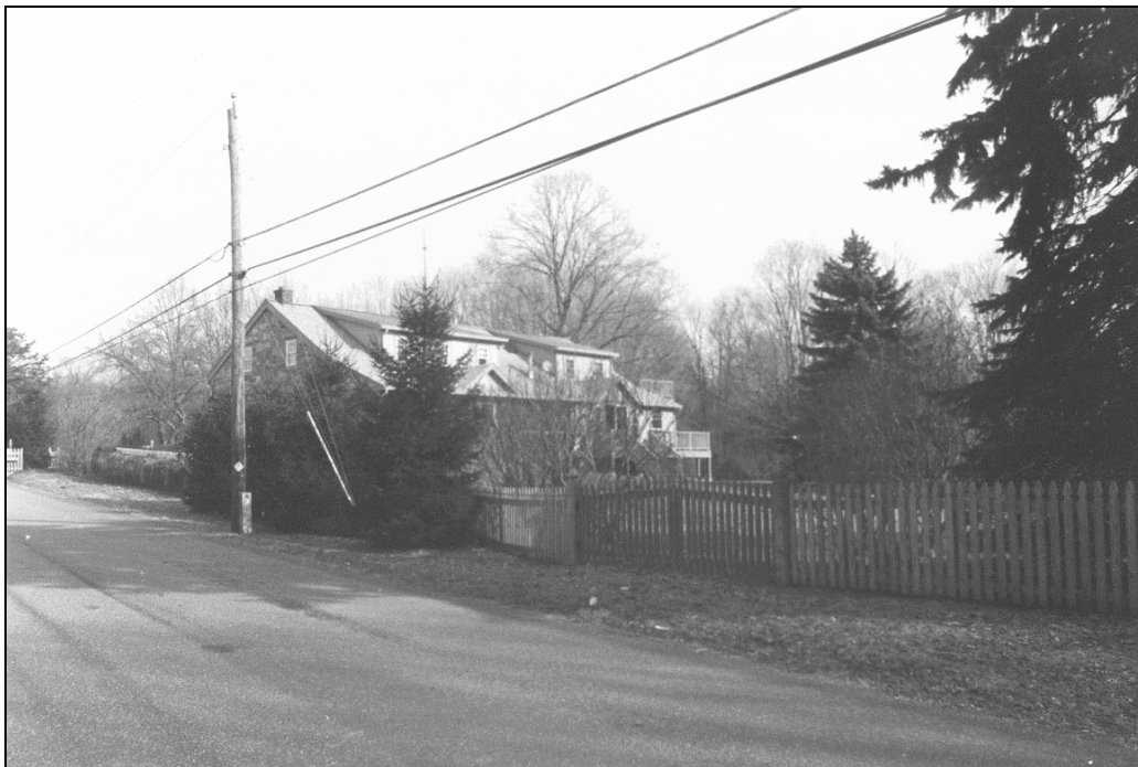
View of house from south.

DuBois-Deyo Farm 420 N. Ohioville Road New Paltz, Ulster County