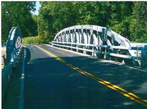
Cambridge Arched Galvanized Hurley over Esopus