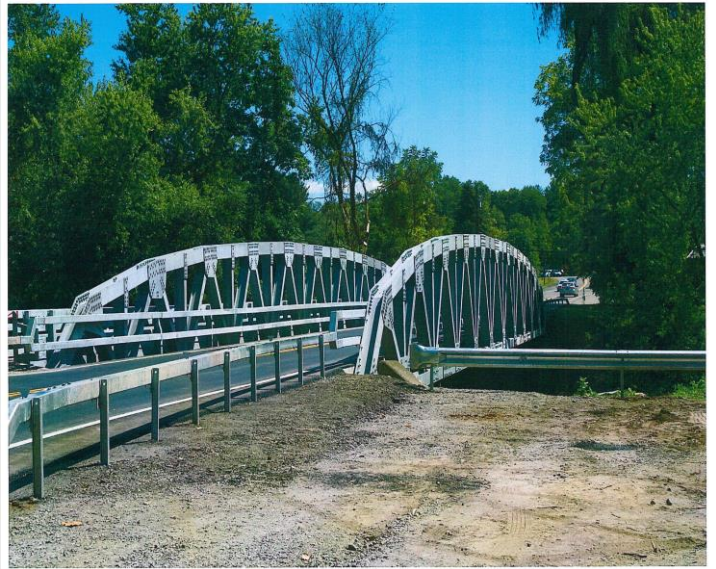
Cambridge Arched Galvanized Hurley over Esopus - side view