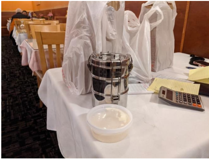
Figure 1 The Tiffin stands proud in a sea of single use plastic!

See that shiny container in the photograph surrounded by single use plastic bags, plastic containers, and perhaps boxes coated on the inside with polyethylene (PE) plastic to make them moisture proof? That shiny stainless steel container is called a tiffin and is one way to reduce your use of single use!