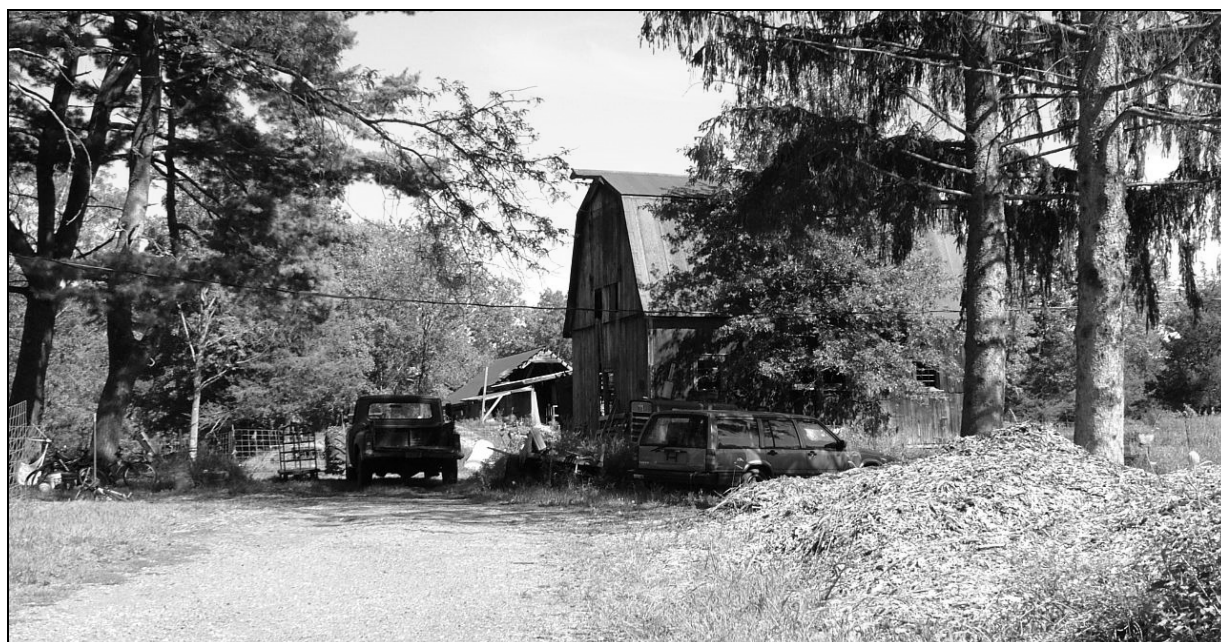
Outbuilding situated southeast of the house, from the west.