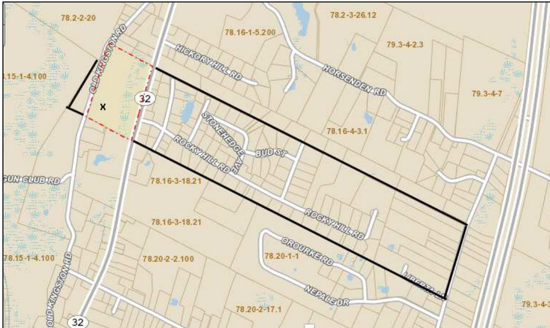
Parcel map with outline of Lot No. 11, Southern Division, First Tier (1760). Elias Ean Farmstead is marked with an X at the extreme western end on Old Kingston Road.