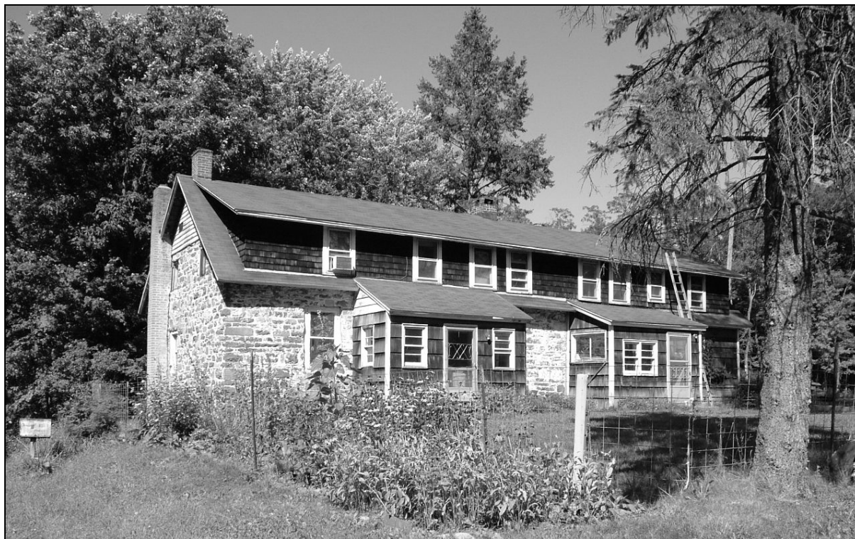
View of the house located on the east side of Old Kingston Road, from the southwest.

Elias Ean Farm 294 Old Kingston Road New Paltz, Ulster County