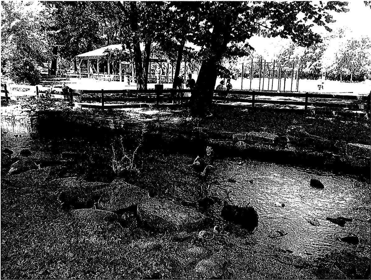
1 Child swimming in Quassaick Creek at Algonquin Park, Orange County.