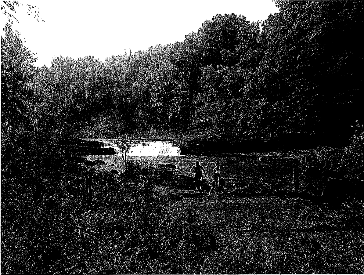
2 Swimmers at High Falls, Rondout Creek, Ulster County.