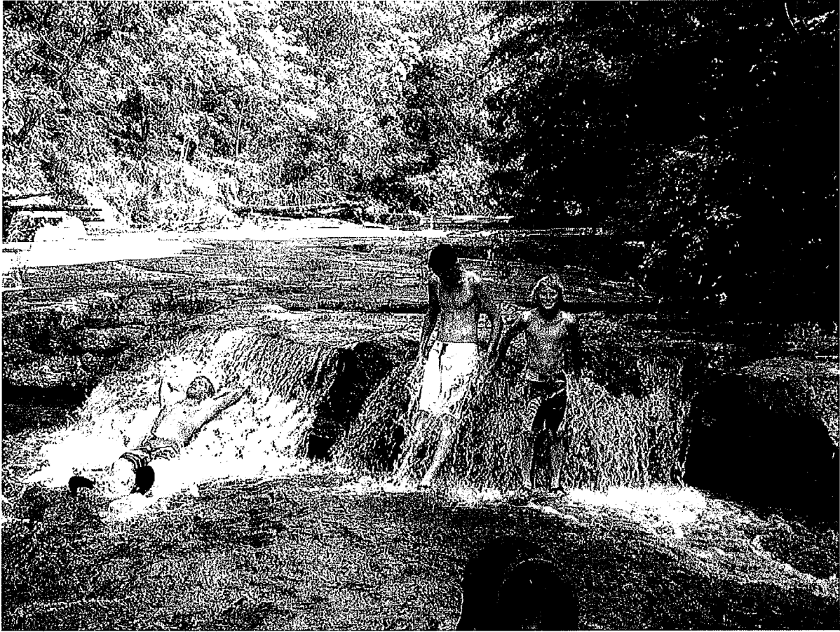
4 Children swimming in Rondout Creek watershed.