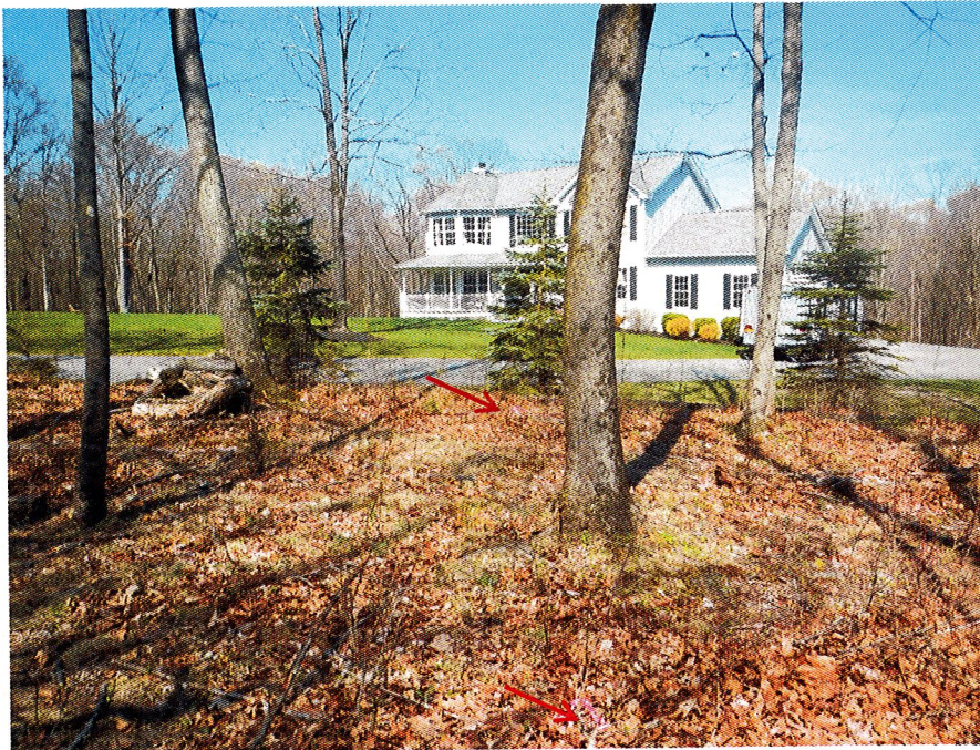
Location A: Photo 1: Approach to the Town's 20-foot right-of-way to the property from north end of Old Mill Road hammerhead, facing approximately ENE.

Property: MBP, Town of New Paltz- "Lent"