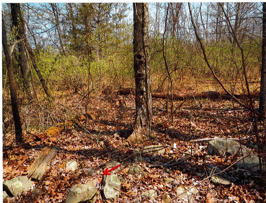
Location 13: Photo 3: View facing approx. WNW along the old stone wall on the northern property line.

Property: MBP, Town of New Paltz- "Lent"