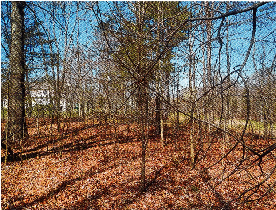
Location 6: Photo 2: View facing approximately ESE into adjacent property, tax lot 86.8-6-17.100. This is the brush pile the corner stake is probably under.

WVLT Baseline Documentation Photo Property: MBP, Town of New Paltz- "Lent " Grantor: Town of New Paltz Date of Photo: April 21, 2016 Wallkill Valley Land Trust Initials: WVLT LB Grantor LB