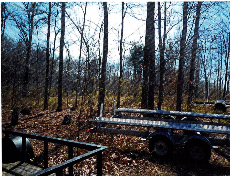
Location 3: Photo 3: View facing approximately NNE into property.

Property: MBP, Town of New Paltz- "Lent"