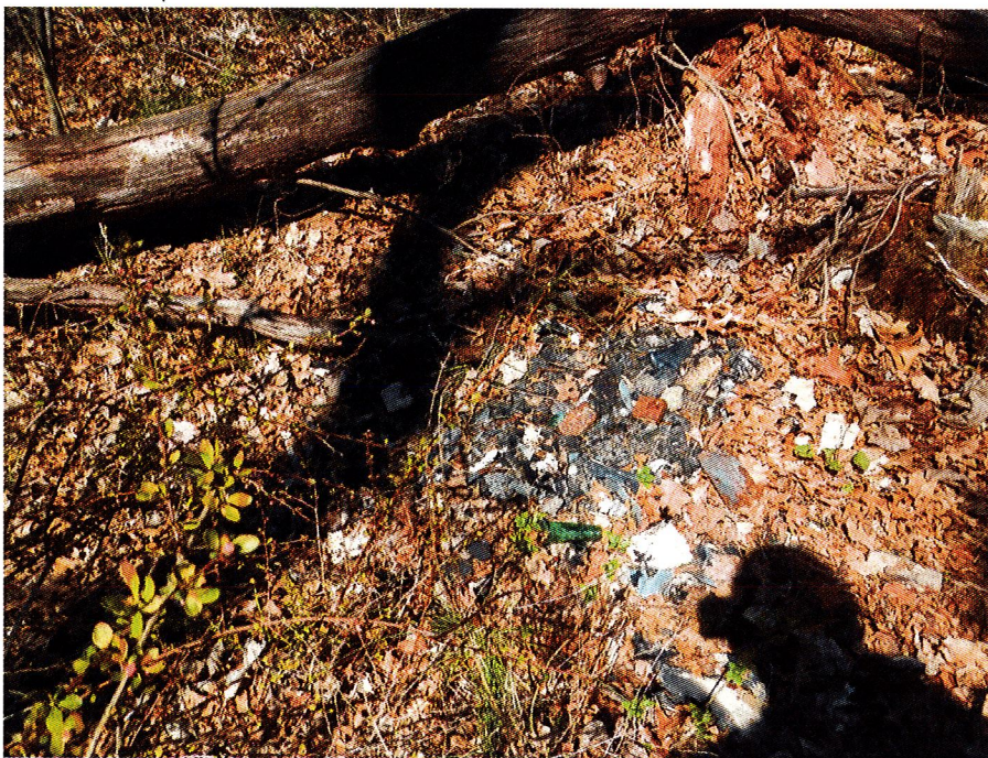
Location 14: Photo 3: View facing approx. ESE along northern property line toward Location 13.

Property: MBP, Town of New Paltz- "Lent"