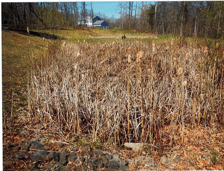
Location 7: Photo 3: View facing approximately NW toward "Pocket Pond."

Property: MBP, Town of New Paltz- "Lent"