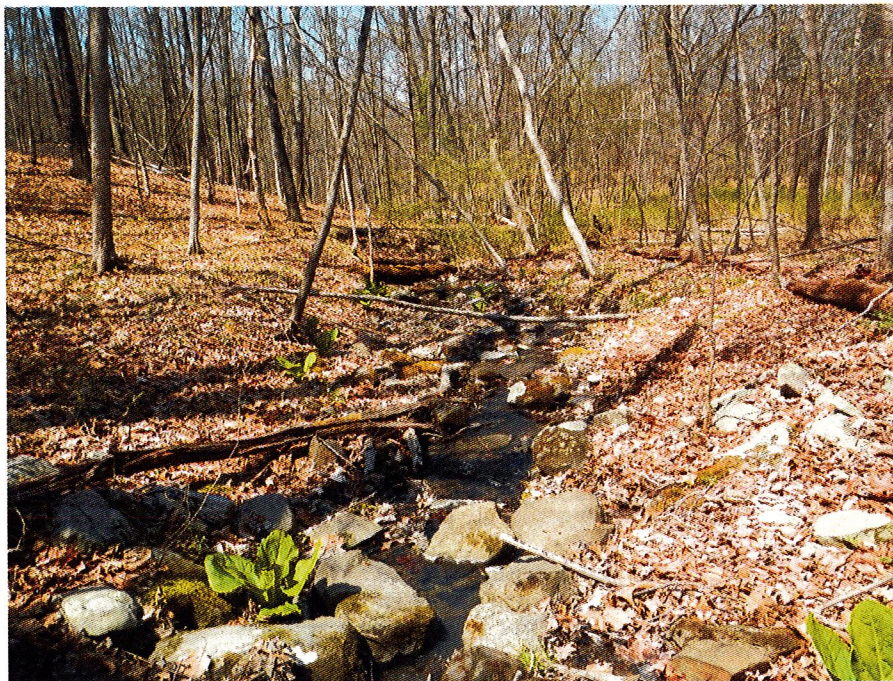
Location 20: Photo 2: View facing approximately NNE along old stone wall on western property line.

Property: MBP, Town of New Paltz- "Lent "