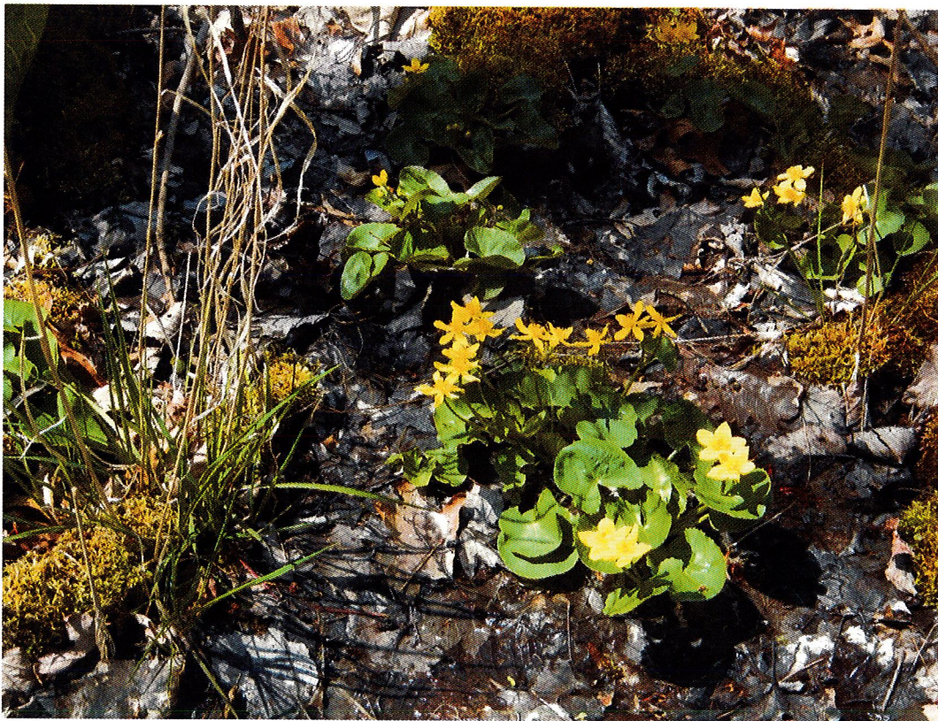
Marsh Marigolds near the northeast corner of the property, April 21, 2016