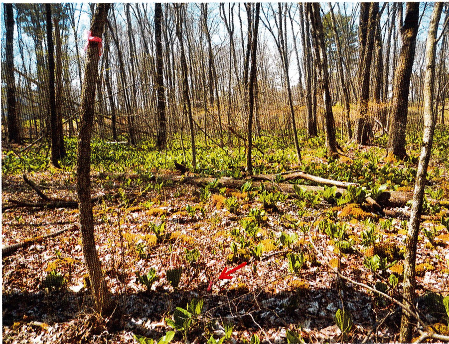
Location 9: Photo 2: View facing approximately WNW into the property along the course of the tiny stream. Bright area of open sky on the left is the "Pocket Pond."

Property: MBP, Town of New Paltz- "Lent"