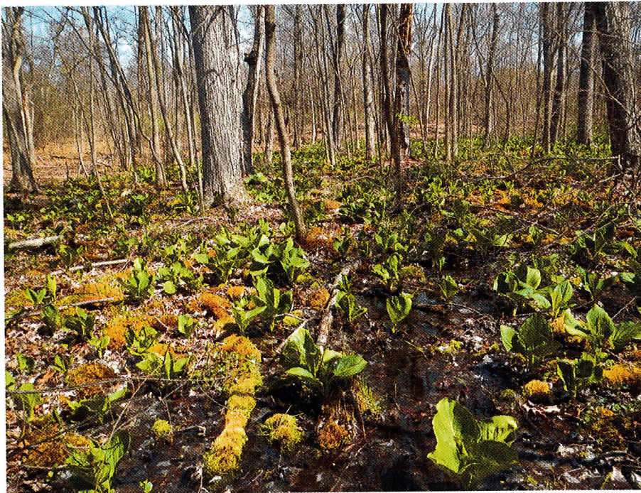
Location 10: Photo 2: View facing approximately WNW along northern property line.

Property: MBP, Town of New Paltz- "Lent"